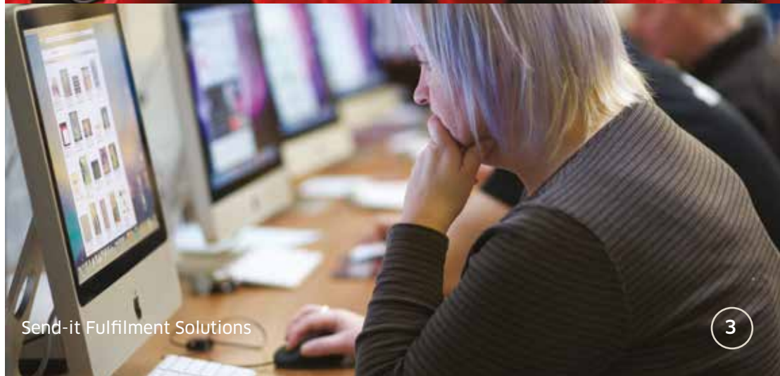
Send-it Fulfilment Solutions