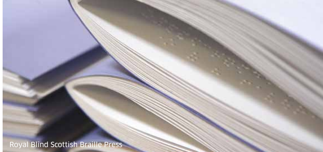
Royal Blind Scottish Braille Press