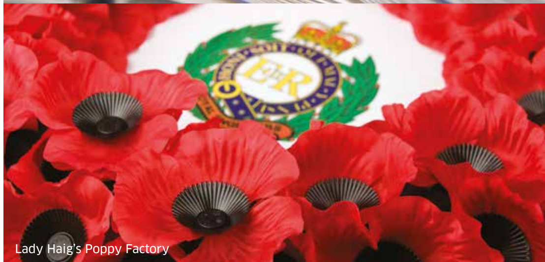
Lady Haig's Poppy Factory